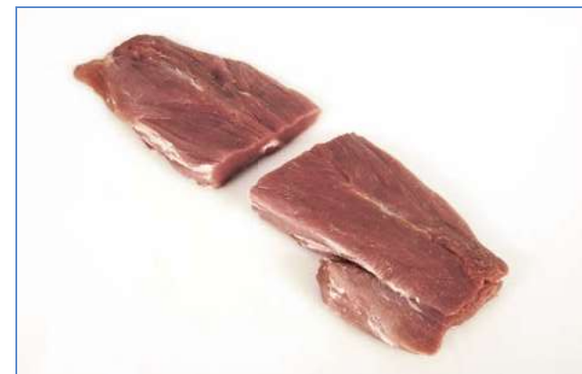
6 Cut the spatchcock in half to create Fillet of Pork Spatchcock portions.