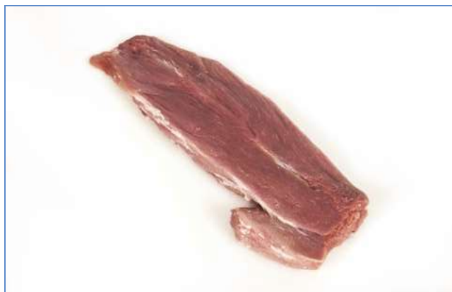
5 Fillet of pork spatchcock.