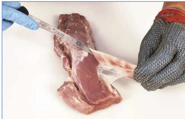
2 Remove chain, the silverskin and fat.