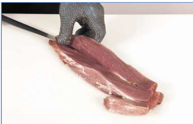
4 ... fillet lengthways.